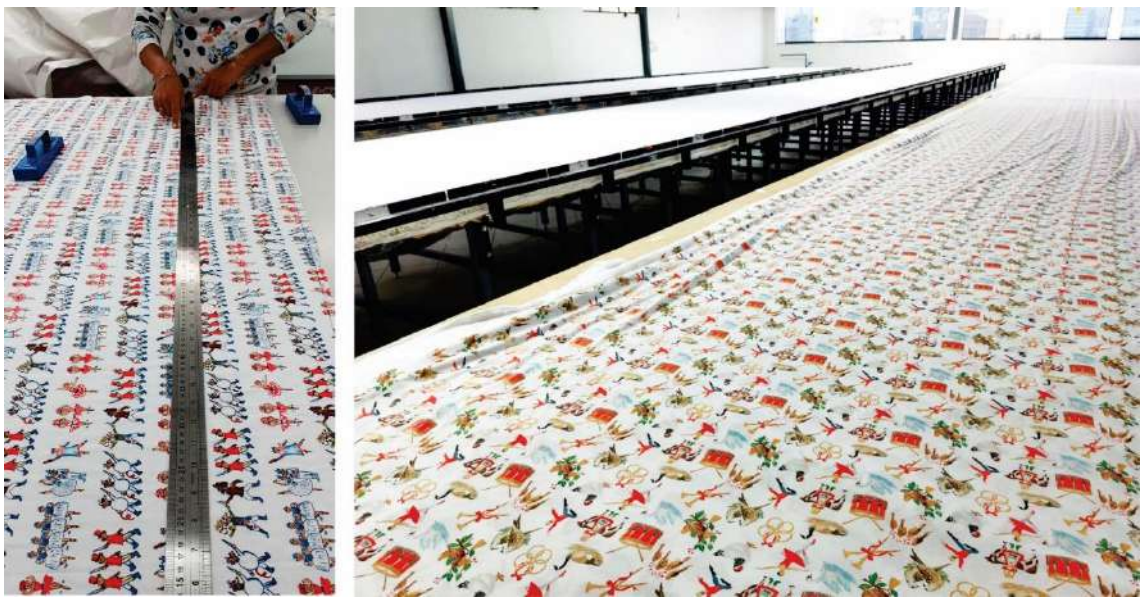
MINIMUM 100 METERS TO CUSTOM PRINT FABRICS